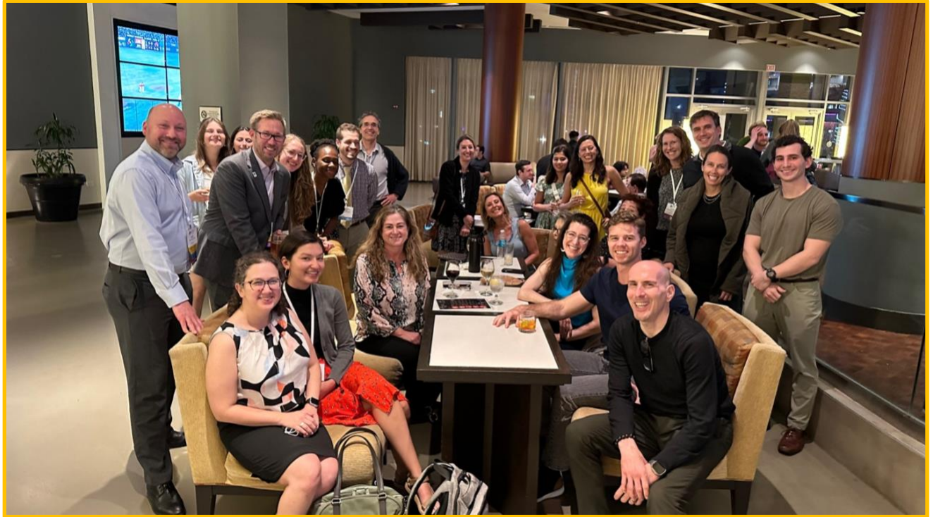
(above) Photo from APS Pitt Night!